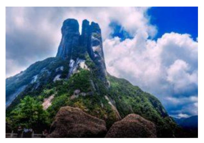
The big stone has two names. One name is "Trinity Stone" Another name is "The Emperor Shun Stone" The Emperor Shun was the trinity of Christ before.

The stone is 360\,\mathrm{meters} high, It is located at the top of Jiuyi moutain in Yongzhou City, Hunan province.